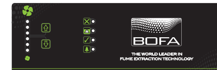
Automatic Flow Control