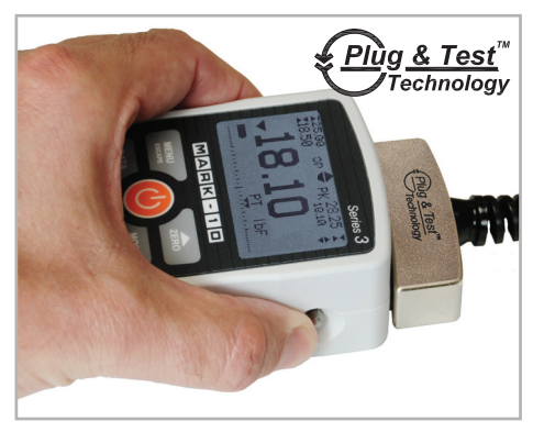
^ The Plug & Test™ connector locks into the receptacle in the indicator when fully inserted. Dual buttons on the indicator housing release the connector for easy removal. Gold plated spring contacts ensure long lasting and reliable connection.