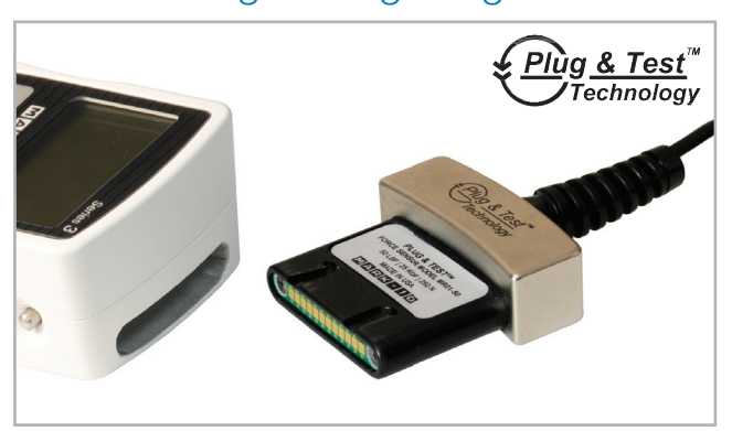
^ Unique Plug & Test™ technology allows for interchangeable sensors to be used with a Mark-10 model 7i, 5i, or 3i indicator. All calibration and configuration data is saved in the smart connector.