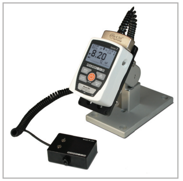
3i is shown mounted to an optional AC1008 tabletop stand with Series R03 force sensor