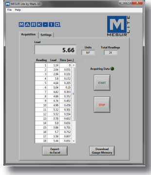
MESUR™ Lite data acquisition software is included with the 3i

The gauges include MESUR™ Lite data acquisition software. MESUR™ Lite tabulates continuous or single point data. One-click export to Excel allows for further data manipulation.